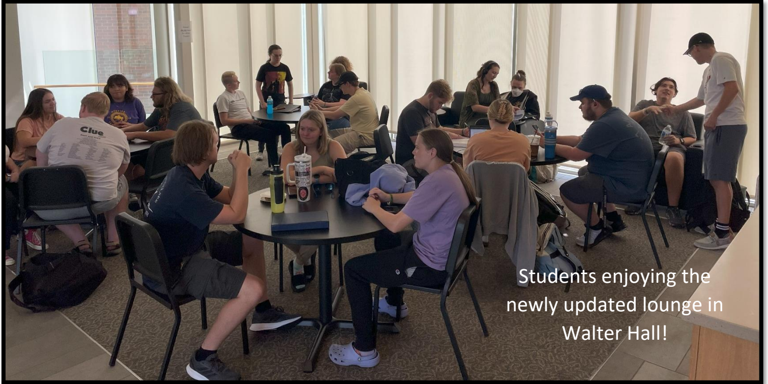
Students enjoying the newly updated lounge in Walter Hall!