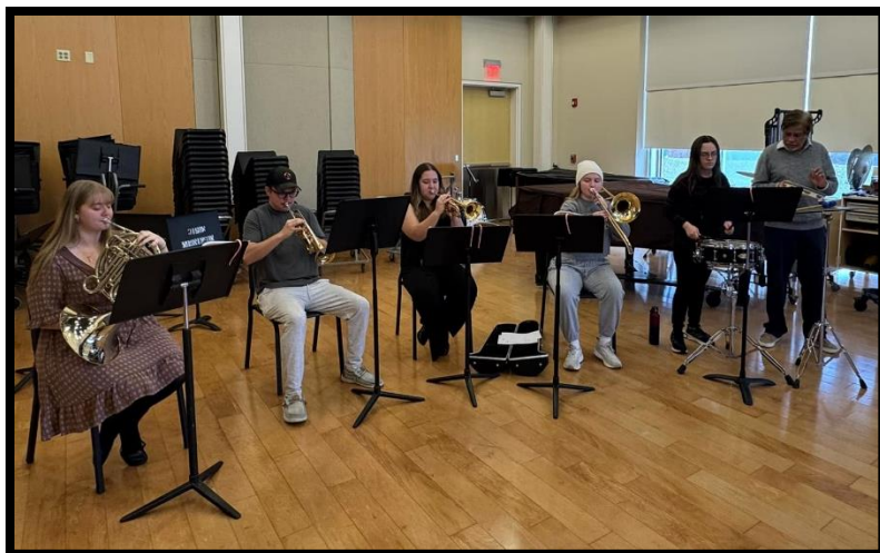
Students in the Brass/Percussion Methods class presented a final class performance of holiday favorites (and refreshments!).