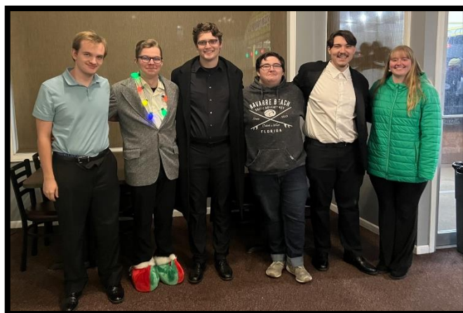
A group of instrumentalists played carols at a community center in Canton.