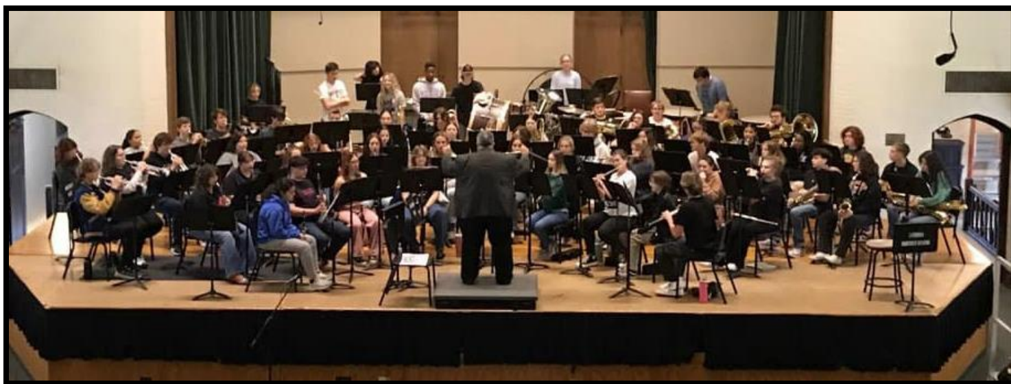
We were thrilled to welcome 140 high school musicians from 19 different high school for the 2024 Instrumental YouthFest. The Festival Band and Honor performed a wonderful concert to a packed Brown Chapel.