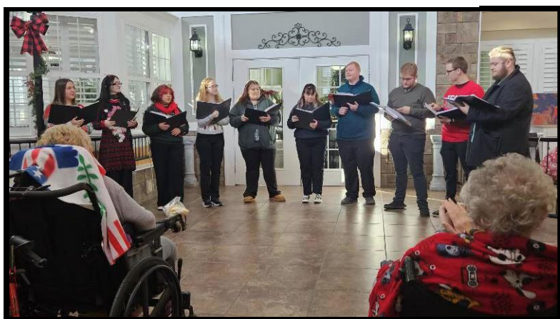
Not So Natural, our student-led a cappella group, sang carols at a local nursing facility.