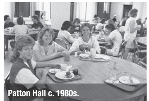
Patton Hall c. 1980s.