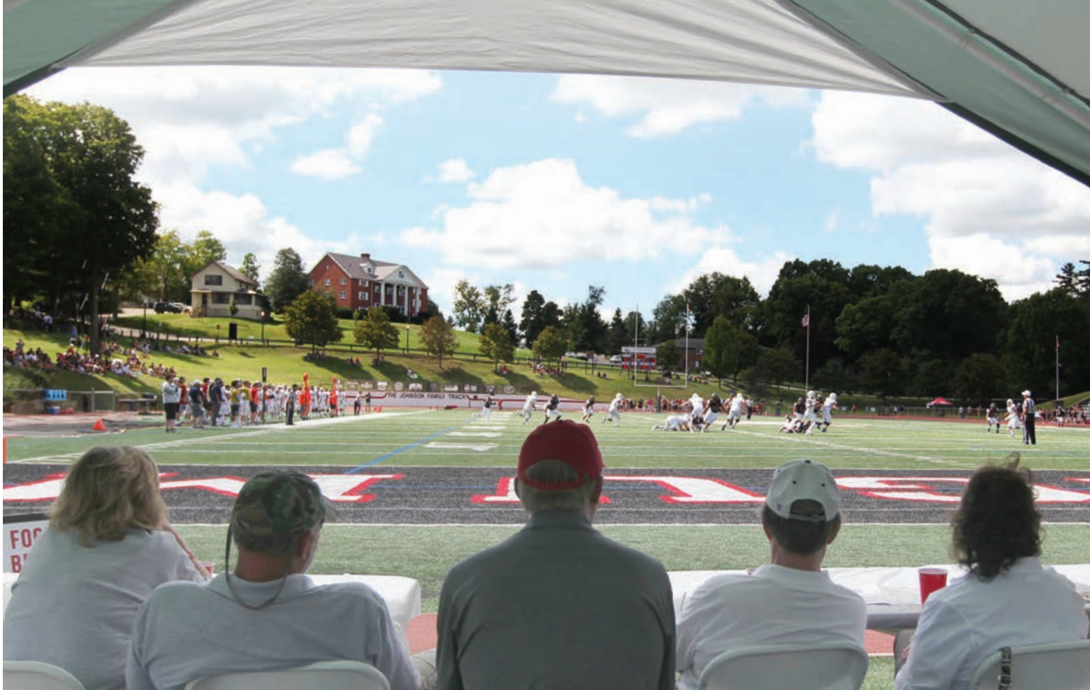
Members of the new Muskie Athletic Club enjoy the field-level view and hospitality from the Touchdown Tent.