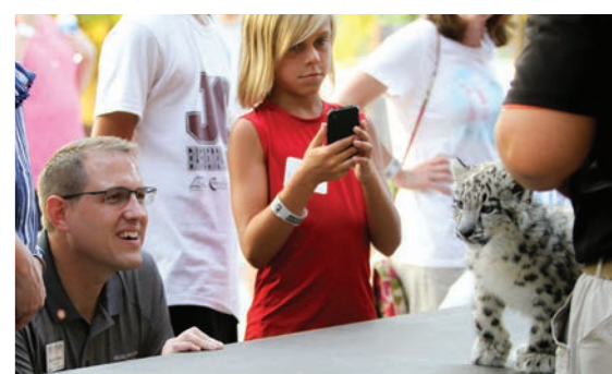
Muskies enjoyed a private animal encounter featuring baby snow leopards and a baby kangaroo.

Nearly 400 Muskies – including alumni, friends, incoming first-year students of the Class of 2021, faculty, and staff – gathered at the Columbus Zoo and Aquarium.