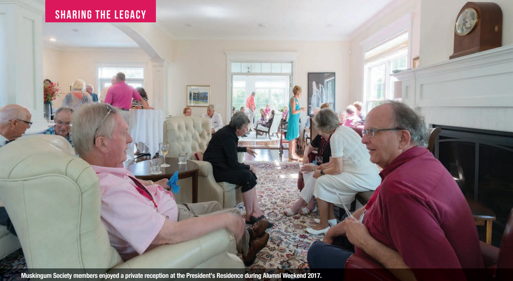
Muskingum Society members enjoyed a private reception at the President's Residence during Alumni Weekend 2017.